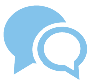
MARKETING & COMMUNICATIONS