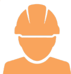
ENVIRONMENTAL, HEALTH & SAFETY